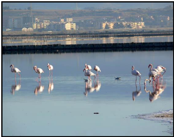
The Fenicotteri is a big attraction of Cagliari